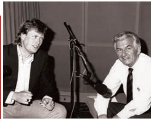
Interviewing Prime Minister Bob Hawke in 1989.