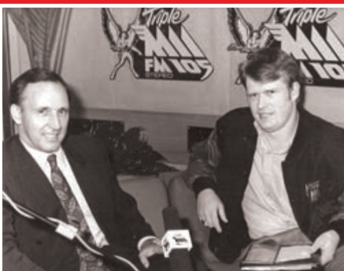
Interviewing Prime Minister Paul Keating during the 1993 election campaign.