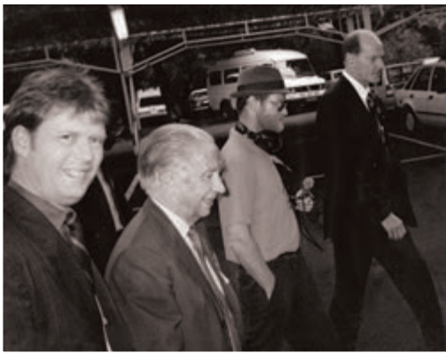
With IOC President, Juan Antonio Samaranch, after Sydney's successful bid for the 2000 Olympics.