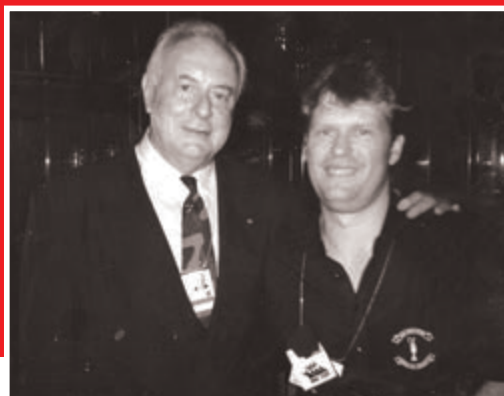
An interview with Gough Whitlam in Monaco.